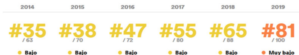
Gráfica 2. Trend of the EP EPI 2014-2019